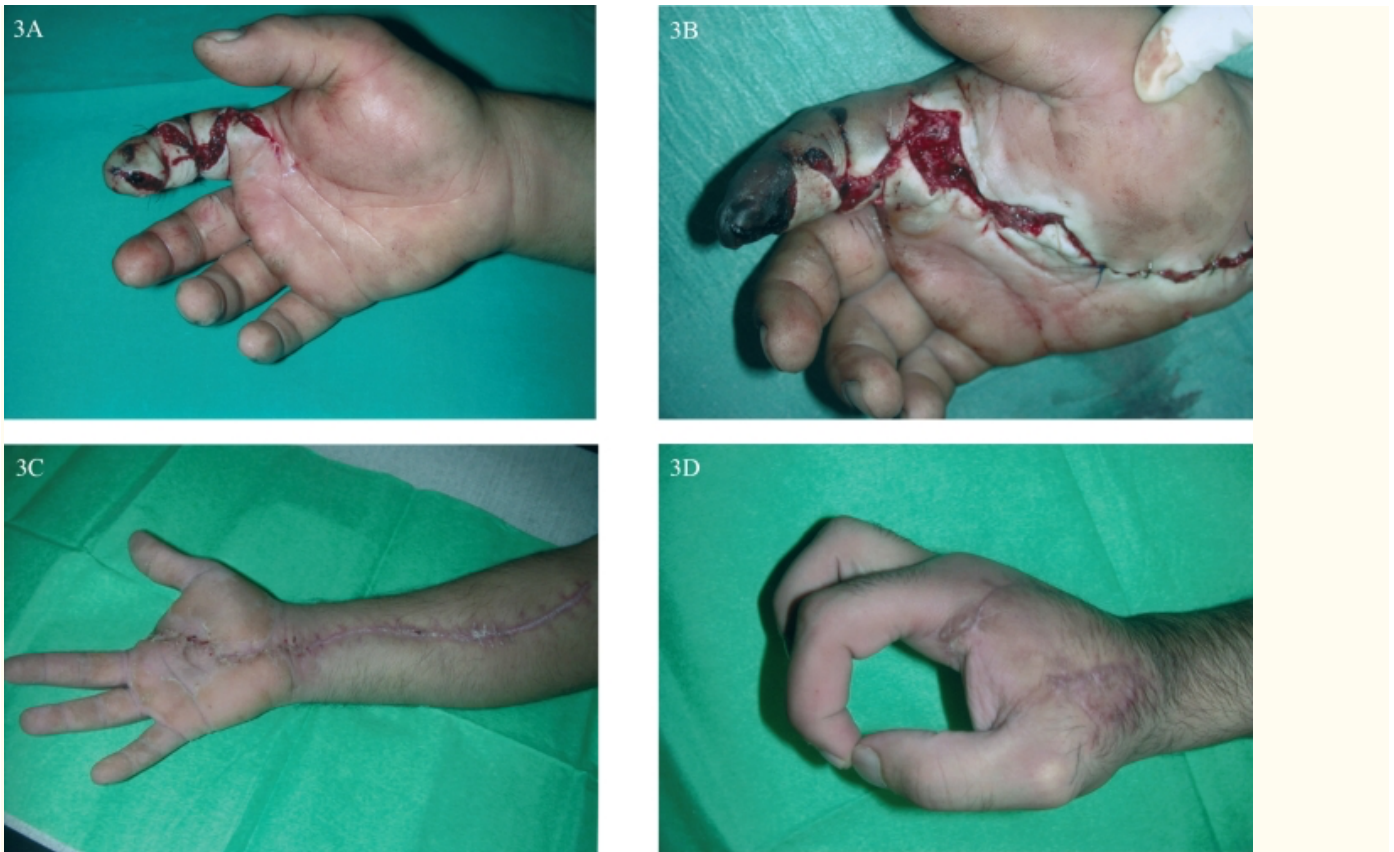
Figure 3. A. A 25-year-old male patient, presented to our hospital 36 hours after an injection injury of his right index with solvent. The patient was treated surgically 20 hours after the injury in another hospital and was transferred to our hospital with signs of systemic toxicity apart of the compartment syndrome of his hand and forearm. B. The patient underwent extended debridement and compartment release, but it was obvious that the index finger was not viable. C-D. Result 6 months after amputation of the second ray.